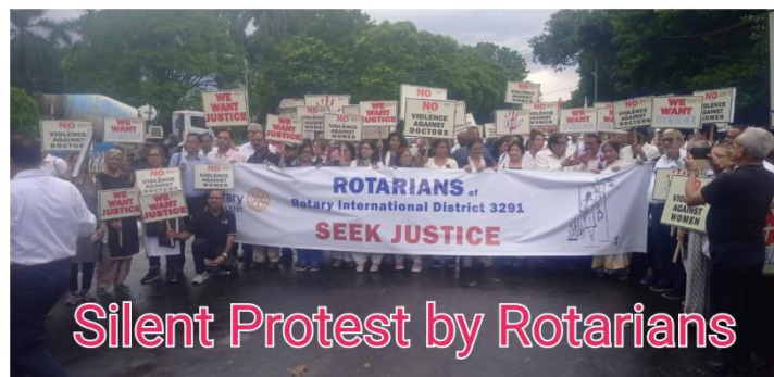
Silent Protest by Rotarians